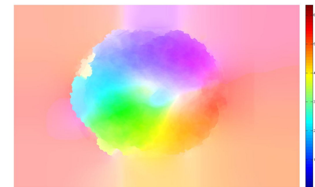
Figure 3. In the left picture we can see the 3-D depiction of the comparison between two vessel segments in two different progress images. In the right picture we can see the optical flow of the comparison between two progress images in order to see the differences through the optical flow.