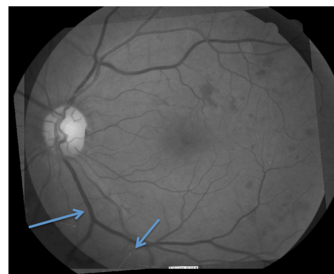
Figure 2. The two images are aligned and registered in order to detect the changes to the retina vasculature. In the highlighted area we can see two areas where there are differences between the two images. In the first case a large vein is dilated which is a sign of diabetic retinopathy since the body tries to regulate the increased blood flow. In the second case an artery has increased curvature.