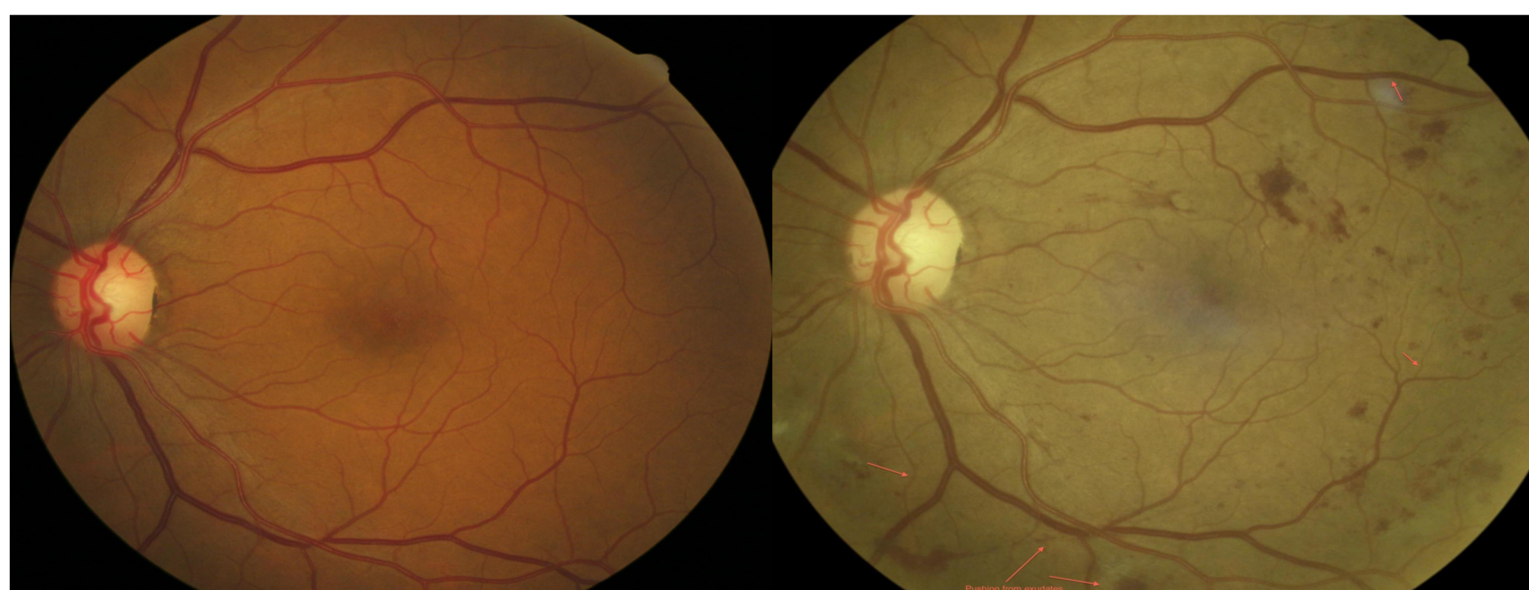
Figure 1. Same patient image before and after Diabetic retinopathy.

Database of 40 patients who developed diabetic retinopathy during diabetic state.